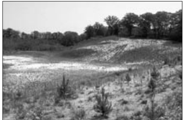
"Reclamation" at Nadeau Pit, Nadeau Site and Busse Property by TechniSand. Too little, too late, every time.

PRESORTED FIRST CLASS US POSTAGE PAID LAKE MICHIGAN MAILERS 49009