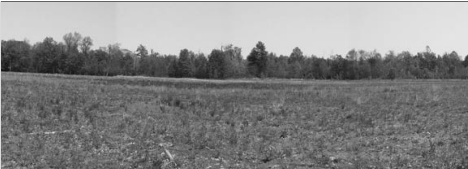
"Reclamation" at the TechniSand/Brown mine leave much to be desired. The mining company has reported that it has planted numerous

Star Highway is zoned Shoreland Residential. This district has further restriction on lot size (minimum 5 acres), setbacks, use (single family residential), etc. Sand mining is prohibited.