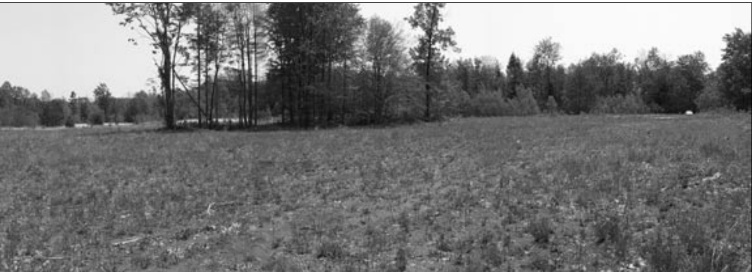
s trees. They are just too small to see in the grass. Here is evidence that TechniSand should never be allowed to mine in Covert again.