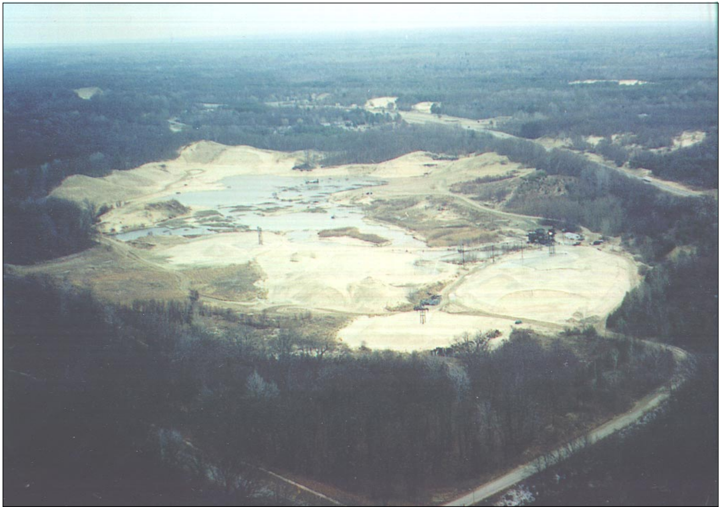
Nadeau Pit, December 1999, showing the extent of destruction. 115 acres of the site have been mined. Only a small portion has been reforested. Portions have been planted with grass. A plant site was added to the mine by amendment. It does not have to be reclaimed until all mining is completed. The DEQ has allowed it to expand to nearly 30 acres, which is the area of all active cells allowed by the law.

briefs and our "application for leave to appeal." If you have not yet done so, visit the web site at: http://www.daac.com/sosdunes/ .