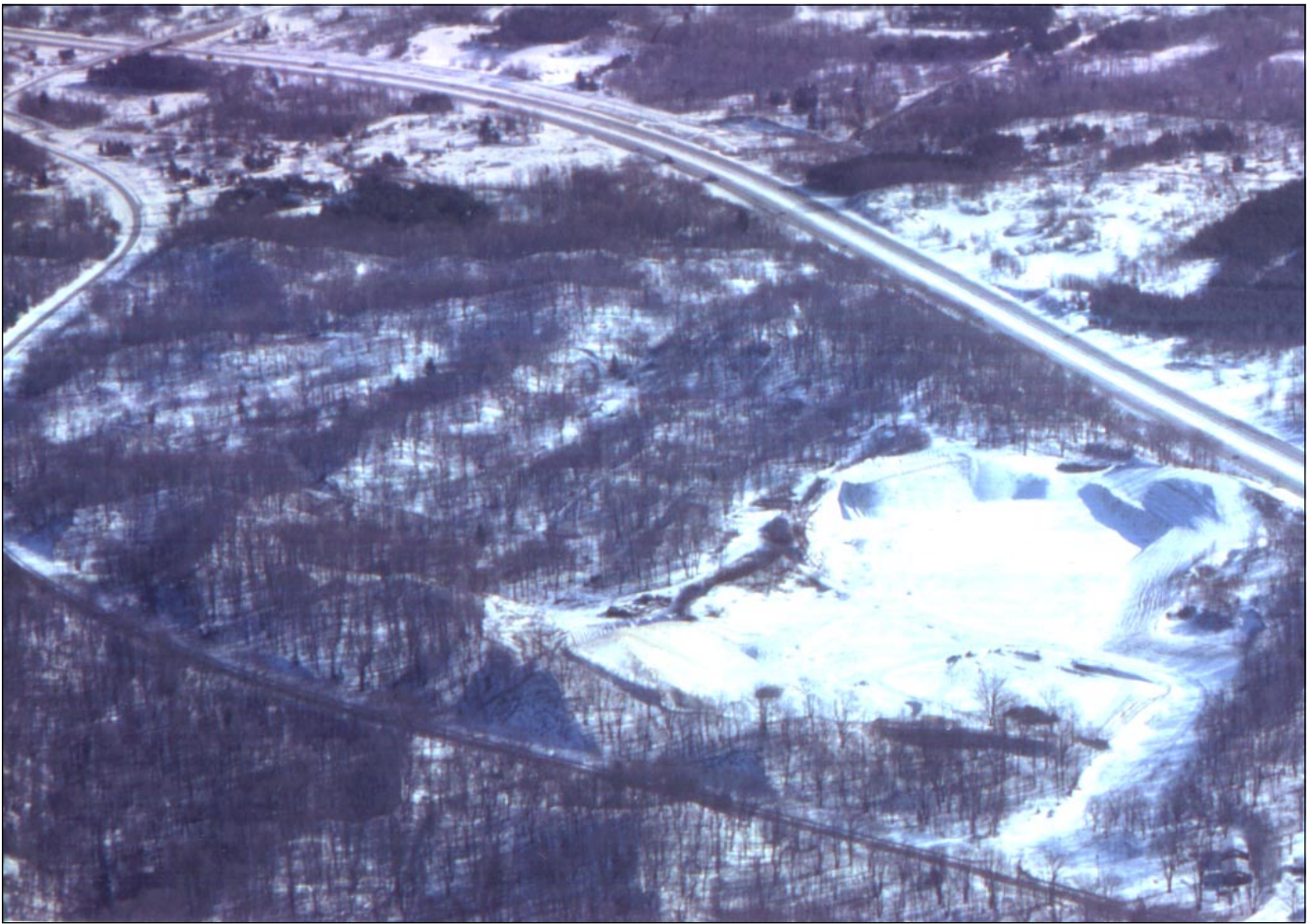
This aerial photograph of Nadeau Pit was taken in the winter of 1978-79. It shows the mine at the time a permit was applied for under the then recently enacted Sand Dune Protection Act. Approximately 30 acres had already been destroyed. The parabolic, horse shoe, shaped dunes are visible just to the north (left in the photo) of the bare area. The entire mine is in what was a "barrier dune."

at least 500 feet from the creek. They stated that their map had shown the creek in the wrong location. Our review of their maps revealed that the creek was accurately located. They just did not know where they were dredging, or else they assumed that no one was looking.