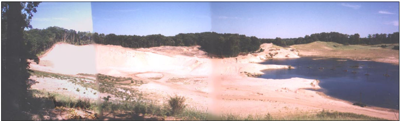
A new cell has been opened at Nadeau Pit. Six to eight more acres have been clear cut. This is the northern most cell and just south of Rogers Creek. Cell 6 is in the upper right hand corner of the photograph. PTD successfully pushed to have it properly replanted before another cell was opened to mining.

Thanks to all of you who have contributed time and hard work in realizing the success that PTD has achieved to date.